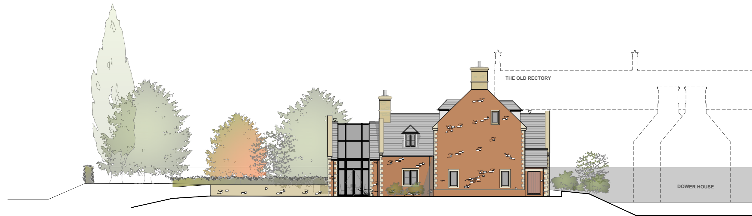
NORTH EAST ELEVATION SCALE 1:200